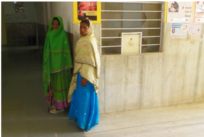
Beneficiaries at a health facility

Sub-Centre, Dewala: The building was located on the Highway. Infrastructure was not adequate. Cleanliness was maintained. Interacted with the ANM who conducts about 5-8 deliveries a month. She has been awarded as the best worker by the state authority. The ANM resides in the quarters. The second ANM is not placed. There are almost 9 villages under the sub-centre. The ANM