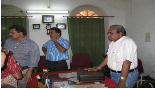
Participants at the District Hospital interacting with CMHO

The participants found the CMHO to be a proactive person. The District Hospital, Hoshangabad had a large catchment area. The district administration was providing good support to the district hospital. The District Hospital had a training centre, SNCU, TB hospital, handicap rehabilitation centre & NRC. Blood bank and Operation Theatres with adequate specialists and equipment were available. Funds were adequate and staff morale was high. Drug supply was adequate. Call centre facility for MCH services/ambulance & referral was available at reasonable rates and free for people with BPL cards. However, sanitation measures and bio-medical waste management systems needed strengthening. Lab services needed to be improved. Ophthalmic surgeries were not being conducted even though facilities were available.