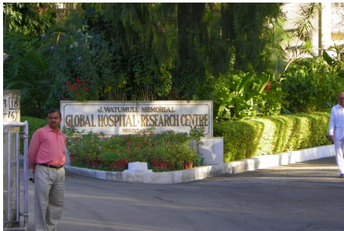
Entrance of the Global Hospital Research Centre at Mount Abu