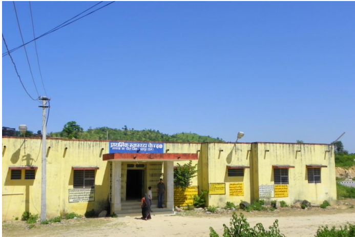
A view of the PHC at Malwa ka Chawrah

Samiti or RMRS (Rajasthan Medical Relief Society) was fully functional. The OPD patient load was quite high.