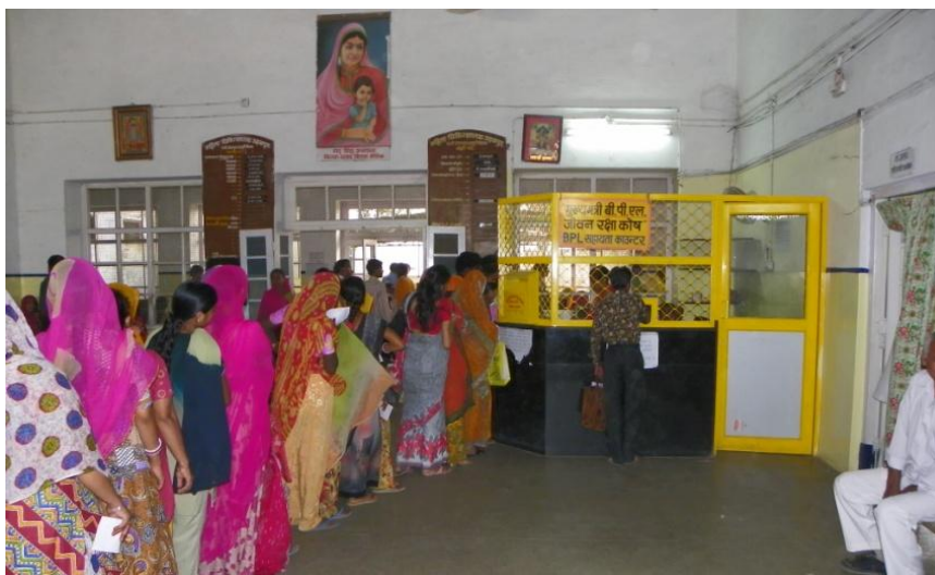
Patients queuing up at the BPL counter in the Hospital