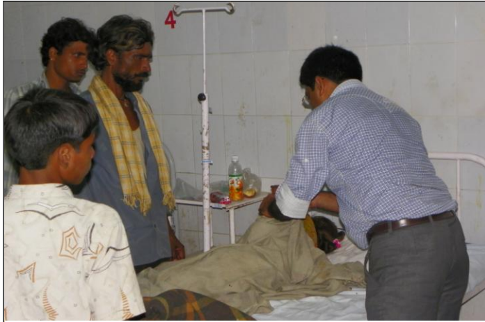
A PDC participant interacting with beneficiary of Narayan Sewa Sansthan at Udaipur