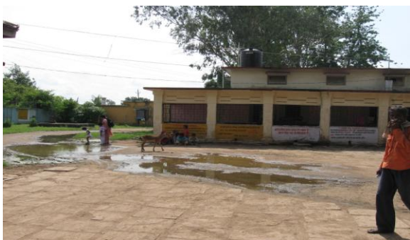
Poor sanitation in the vicinity of the District Hospital