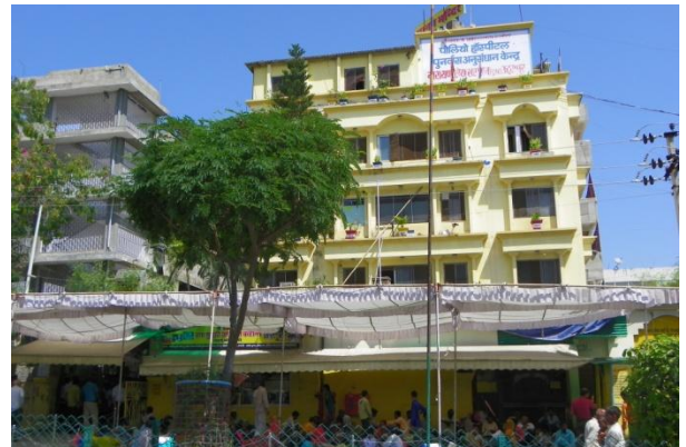
Narayan Sewa Sansthan Polio Rehabilitation Center at Udaipur

7. Gitanjali Medical College, of Udaipur with 350 bedded hospital. It is of state of art quality, tertiary level care. Land was provided by PRI and UIT on concessional rate. The subsidized treatment is given to BPL patients. The team felt that monitoring is required to ensure compliance to the terms of mutual agreement and social obligations.