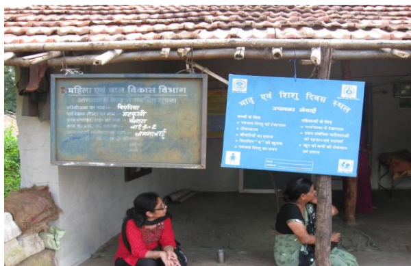
Participants observing the functioning of an anganwari centre

The PDC team visited sub-centres at Pagara, Pawarkhera, Rasselpur and Pathrota. The sub-centre at Pathrota was an accredited sub-centre. The team also visited the anganwadis at Keeratpur and Pagara.