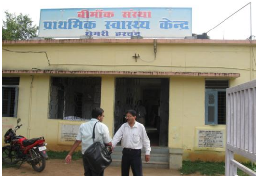
Participants being welcomed at a Primary Health Centre

The team then visited CHCs and PHCs at Pachmadhi, Pipariya and Semari Harchand.