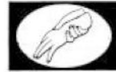
(6) The wrists & arms upto elbows

Planning a newborn corner: Next take participants to the newborn corner. Discuss with participants that newborn corner should be located in that part of the labor room which is away from draughts and windows. Highlight that the material that should be available at a newborn corner should include: