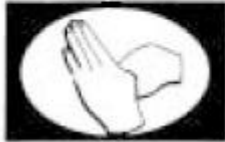
(4) The thumbs