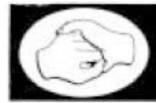
(3) Wash fingers & knuckles