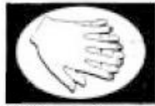
(1) The palms and fingers