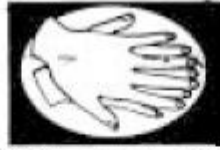
(2) The back of hands