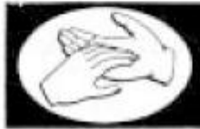
(5) The finger tips