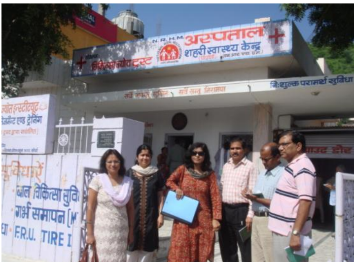
Participants and Faculty at a Facility During Field Visit Udaipur

The team also visited the “School Child Health Care Programme” under Shaala Swasthya Programme in Udaipur itself. This provides comprehensive health care to government school children supported by Government of Rajasthan and Nandi initiative