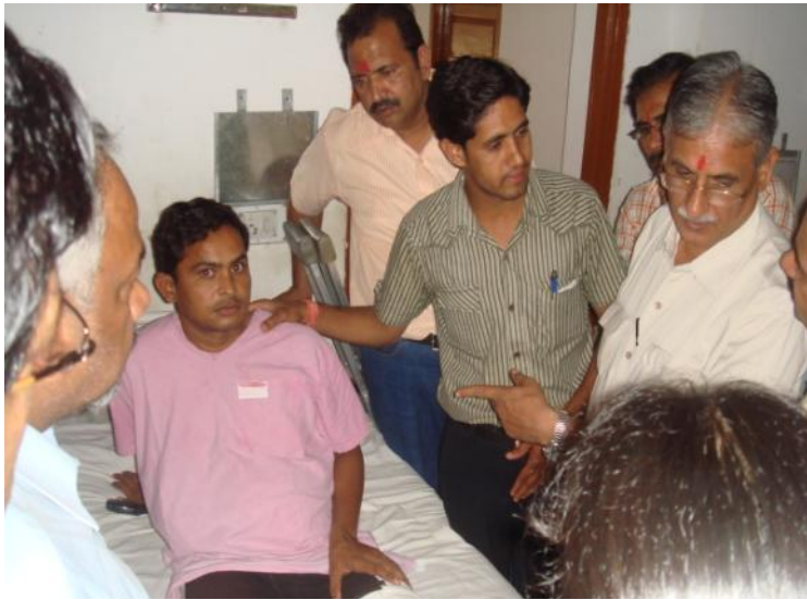
Participants Interacted with Patient and Staff at Narayan Sewa Sansthan, Udaipur

The Centre is being run by an NGO-Chiktsa Jyoti trust. It caters to 25-30 patients daily. It only runs OPD services. The staff was being paid a salary by NRHM. Ante-natal care and immunization is being given here. Family planning methods like Copper T insertion is done. There was no awareness of biomedical waste management. This centre was not doing much for the public and this partnership does not show much advantage regarding MCH services. The team was of the opinion that such arrangements do not benefit much.