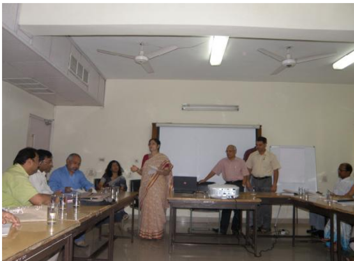
A Class in Progress

A half day visit to NAZ foundation was organized to observe how the home-based care programme for HIV/AIDS children is run by the NGO with meager financial support by the Government.