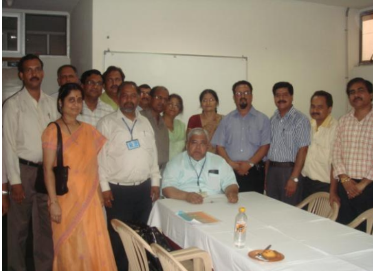
In the Holy Family Hospital with Director of Holy Family

A visit to Holy Family Hospital an ISO certified, 300 bedded and average 800 OPD attendance hospital was organized to describe to the participants different aspects of quality management in a hospital like client and provider friendly facilities, quality of infrastructure & service, team-work, capacity building and work culture.