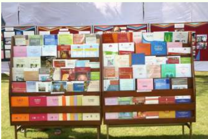
Publications of the Institute are displayed on Annual Day.