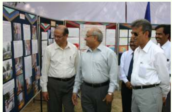
Dignitaries take a look at the exhibition put up by the Institute.